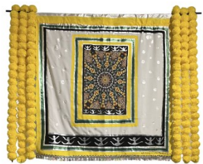
Neha Misra From the Kaleidoscope Eco-Mandala Series: We Belong to Mother Earth, 2024 Digital print, acrylic, thread, and dreams on chiffon 37 × 47 inches Not for sale