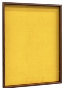
Kat Thompson RGBY: Yellow Is for the Sunshine, 2023 Engraved acrylic and archives reprinted on adhesive paper 25 × 19 inches $500