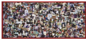
Kat Thompson Nuff Love from Me to You, 2023 Archives reprinted on Photo Tex and wood, paint, fabric, and thread 2 1/2 × 81 1/2 × 37 inches $4,000