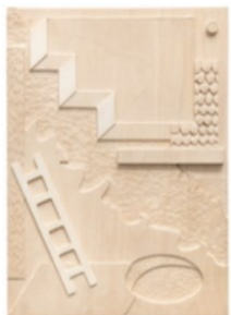
Hien Kat Nguyen Barking Up the Wrong Tree, 2022 Basswood and soap 20 × 14 × 1 1/2 inches