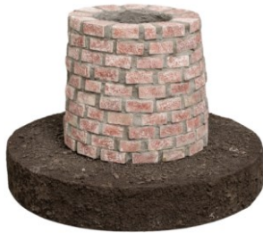
Hien Kat Nguyen Who Owe the Vietnamese One Thousand, One Hundred Twenty, 2023 Clock running at GMT+7, pine wood, soil, cement, joint compound, and pigment 26 × 40 inches in diameter $899