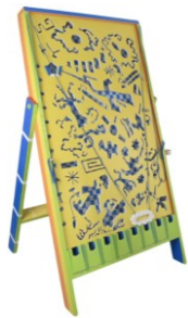
Hien Kat Nguyen All or Nothing, 2021 Pine wood, paint, chains, rope, and metal ball 81 × 47 1/4 × 43 3/4 inches $1,280