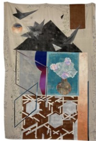
Ali Kaeini Untitled , 2023 Natural dye, fabric dye, acrylic, spray paint, and fabric collage on raw canvas 108 × 74 inches $4,000