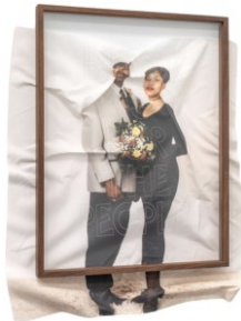
Kat Thompson RGBY: Black Is for the People, 2023 Engraved acrylic and archives reprinted on adhesive paper Dimensions variable Not for sale