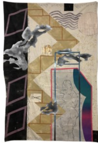
Ali Kaeini Stairs and Smoke , 2023 Natural dye, fabric dye, acrylic, spray paint, and fabric collage on raw canvas 108 × 74 inches $4,000