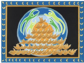
Neha Misra From the Murmurations Series: Murmuring Earth Songs of Migratory Bird People III, 2023 Acrylic, ink, and dreams on mix media paper Framed: 22 1/2 × 28 1/2 inches $2,500