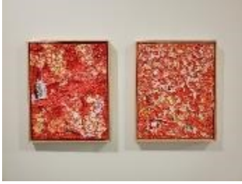
Jing (Ellen) Xu Fall #2, 2020 Acrylic and modeling clay on canvas 20 × 16 inches each $950 each