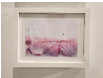
Billy Friebele Decomposition 1.2 (luminescent residue) , 2021 Archival pigment print 11 × 14 inches $500

Notes: The print is reversible. Front of inkjet print displayed / includes HD video file.