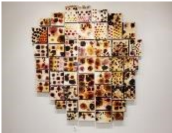
Selin Balci Colony '50' , 2021 Mold spores on boards covered with resin 50 pieces: 96 × 108 inches, $10,000 for whole installation 8 × 8-inch and 6 × 8-inch panels, $200 each 8 × 10-inch and 10 × 10-inch panels, $250 each 9 × 12-inch and 12 × 12-inch, $300 each

Notes: This work can be sold after it grows during the exhibition period, then resined at the end.