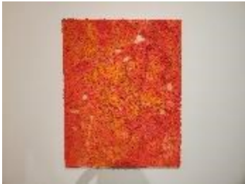
Jing (Ellen) Xu Fall #3, 2021 Acrylic and modeling clay on canvas 33 × 26 inches $2,800