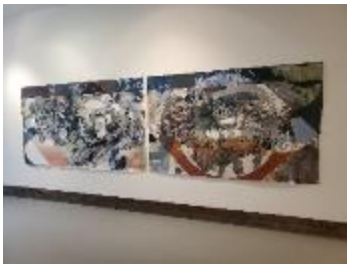
Katherine Tzu-Lan Mann Memory Palace , 2021 Acrylic, sumi ink, and collage on paper 60 × 140 inches NFS