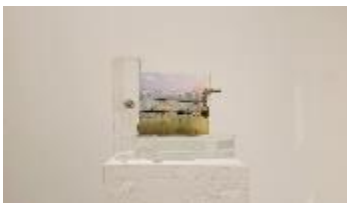
Billy Friebele Decomposition 1 , 2021 Ice, water, Plexiglas, marker, hardware, inkjet photograph of Salatiga, Indonesia taken by the artist, and time 14 x 11 1/2 x 6 inches $500

Notes: The print is reversible. Back of inkjet print is displayed / includes HD video file.