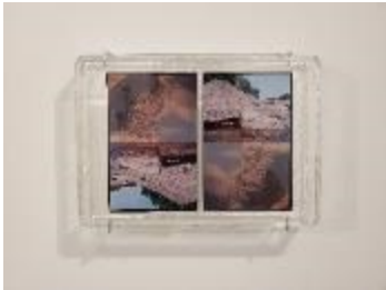
Billy Friebele Inversion 1.2 (spelunking light beams) Inkjet video stills embedded in resin 7 1/4 × 10 1/2 inches $500