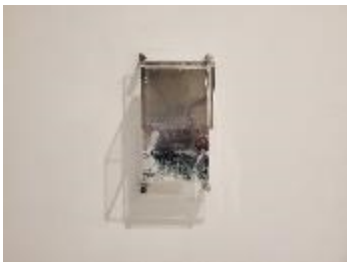
Billy Friebele Submersion 1.1 (swamped network) , 2021 Inkjet video stills embedded in resin with Plexiglas 9 3/4 × 5 1/2 inches $500