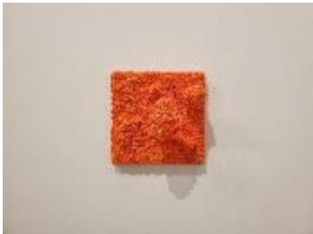
Jing (Ellen) Xu Fall, 2020–2021 Acrylic and modeling clay on canvas 8 1/2 × 8 1/2 inches $400