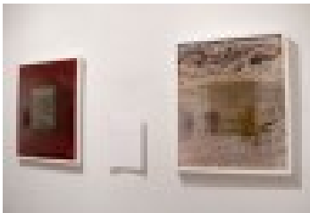
Rachel Guardiola Found Underground, Sector I & II , 2016 C-prints 24 × 20 inches each NFS