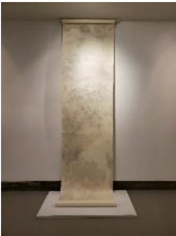
Jing (Ellen) Xu spring , 2018 Pencil on paper 360 × 42 inches NFS