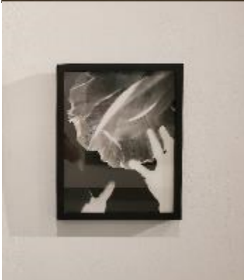
Rachel Guardiola Mementos that Time Forgot , 2019 Silver gelatin print 14 × 11 inches $750