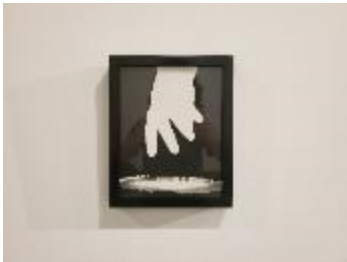
Rachel Guardiola Mementos that Time Forgot, 2019 Silver gelatin print 10 × 8 inches $950