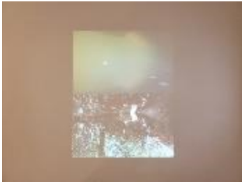
Billy Friebele Inversion / Submersion, 2021 Video 7:08 minutes