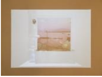
Billy Friebele Decomposition 1, 2021 Video 1:47 minutes Filmed by Meagan Estep