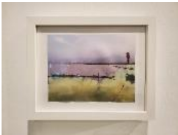
Billy Friebele Decomposition 1.1 (flashy flood) , 2021 Ink and water on inkjet photograph of Salatiga, Indonesia, taken by the artist in a museum archival frame with UV glass 11 × 14 inches $500

Notes: The print is reversible. Front of inkjet print displayed / includes HD video file.