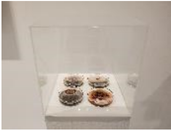
Selin Balci Terra , 2021 Evolving mold spores on glass petri dishes and nutrient medium 4, 4-inch glass Petri dishes $1000 for the installation, or $250 each

Notes: This work can be sold after it grows during the exhibition period, then resined at the end.