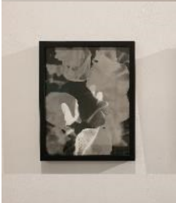
Rachel Guardiola Mementos that Time Forgot , 2019 Silver gelatin print 14 × 11 inches $900