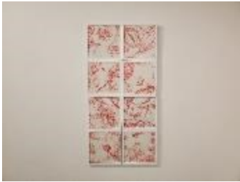
Jing (Ellen) Xu Summer, 2021 Pen on paper 12 × 12 inches each $400 each, $3,040 for whole installation