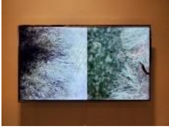
Selin Balci Quorum Sensing , 2011 Video 2:24 minutes $500