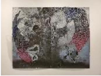
Katherine Tzu-Lan Mann Net. , 2011 Acrylic, sumi ink, and graphite on layered cut papers 84 × 102 inches NFS