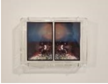
Billy Friebele Inversion 1.1 (river rock portal) , 2021 Photographs embedded in resin 7 1/4 × 10 1/2 inches $500